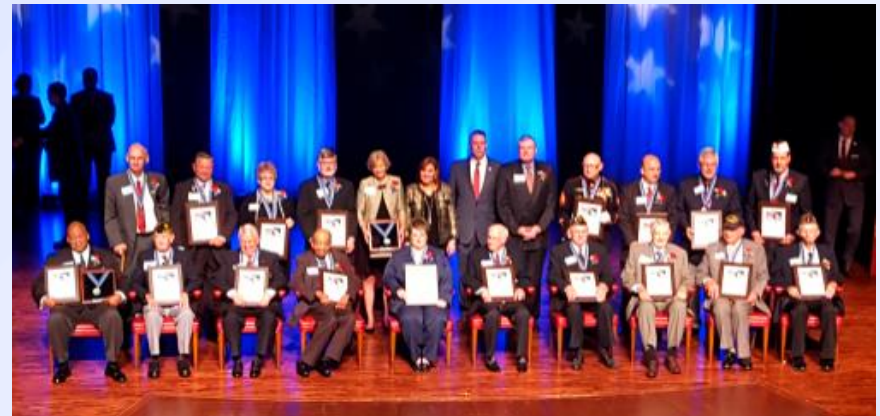
Ohio Veterans Hall of Fame Class of 2015