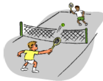
Free Tennis Lessons