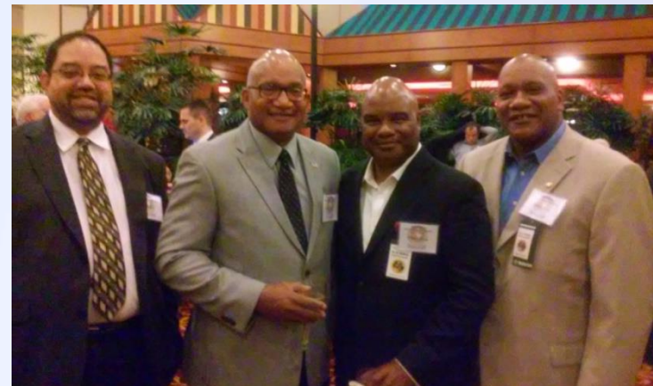
Ohio Veterans Hall of Fame Foundation Dinner