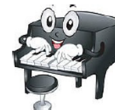
Free Piano Lessons