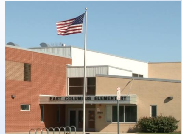
East Columbus Elementary School