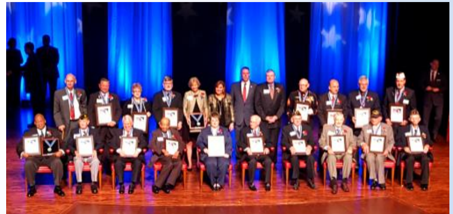
Ohio Veterans Hall of Fame Class of 2015